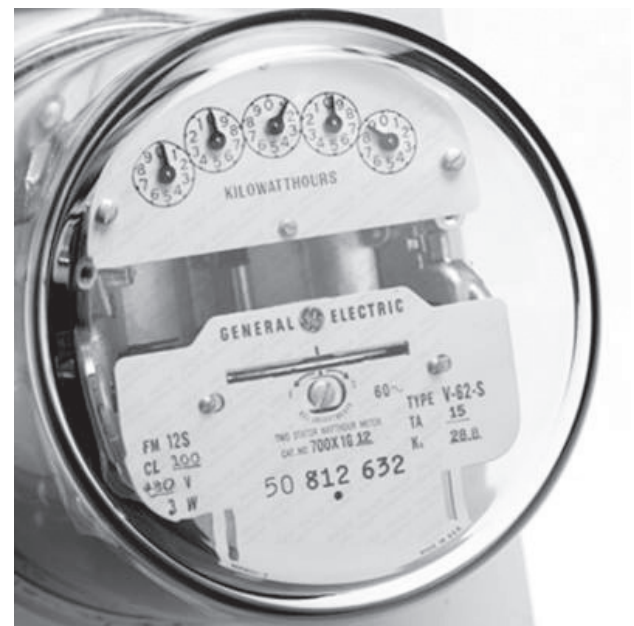
These older meters will soon be gone and making way for the new Cannon system.

Crews began installing the system at Cooperative substations in November. Once all of the substations are ready, focus will then turn to the individual homes for replacement of their meters, which will begin very soon.